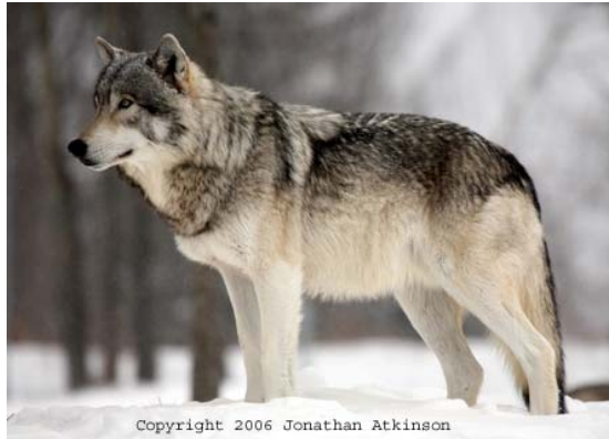
Example of a Keystone Species - the Grey Wolf

Keystone Abilities are derived from the biological term “Keystone Species“. These are plant/animal species that have a disproportionate effect on their environment. In other words, their presence (even in very small numbers) have a big effect on everything else around them. So if these Keystone Species are ok, then the surrounding environment is almost certainly ok too.